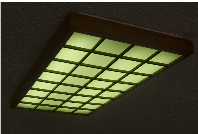
Fluorescent light/Daylight WB

Take note of the WB settings for each picture at each preset: auto white balance, daylight, tungsten, fluorescent, and then evaluate them. What color was the result of each preset? Which looks neutral and which has the craziest color. The neutral image will be the proper preset for the white balance you're in while the craziest color is likely the opposite.