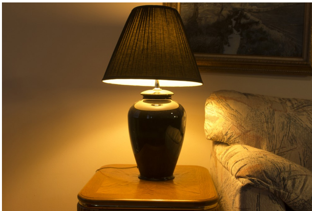
Tungsten Lamp/Daylight WB

This exercise is about white balance and here are some ideas to try and grasp a full understanding of how it works. Inside your own home, or elsewhere, find a light source like lamps that are tungsten colored, or kitchen lights that might be fluorescent, and take a photo using the proper white balance presets.