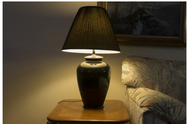
Tungsten Lamp/Tungsten WB

Take note of the WB settings for each picture at each preset: auto white balance, daylight, tungsten, fluorescent, and then evaluate them. What color was the result of each preset? Which looks neutral and which has the craziest color. The neutral image will be the proper preset for the white balance you're in while the craziest color is likely the opposite.